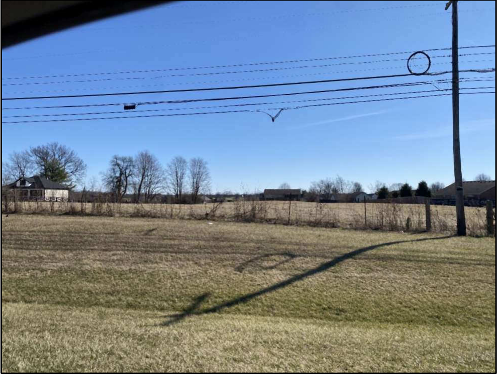
REAR VIEW OF SUBJECT PROPERTY