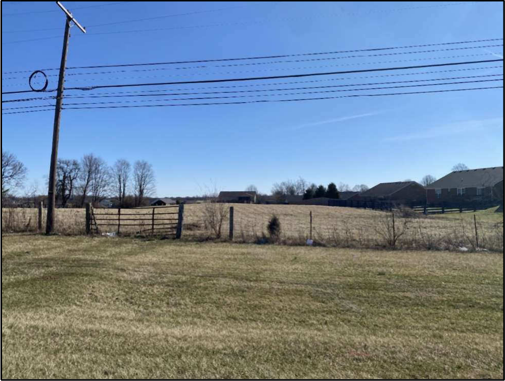
FRONT VIEW OF SUBJECT PROPERTY