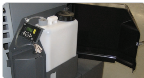
Captor® AXP™ allows control of detergent usage and the ability to use your choice of detergent