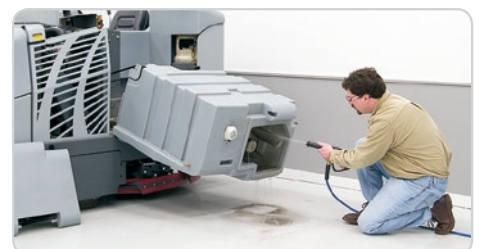
The tip-out recovery tank makes equipment clean-up safe and simple and helps keep your recovery tank fresh