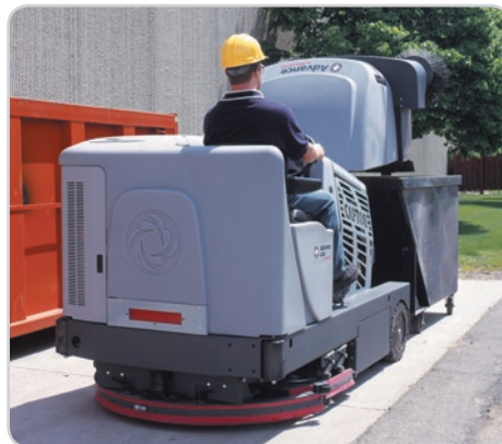
The ergonomic Clear-View™ design provides the operator with an unobstructed view of critical sweep zones