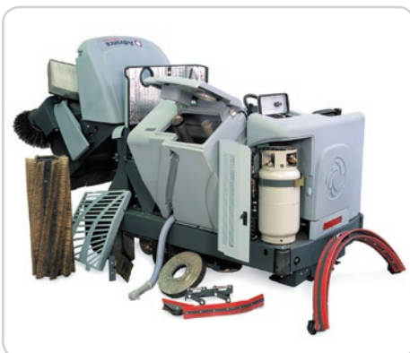
All major systems of the Captor® are readily accessible for easy inspection, cleaning and maintenance. Common maintenance and inspection operations can be completed without tools