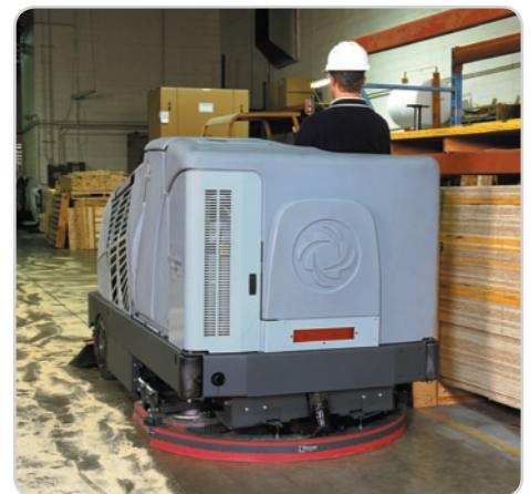
Aggressive scrub system removes ground-in dirt, while the squeegee leaves floors dry. Combined, you get complete cleaning in a single pass