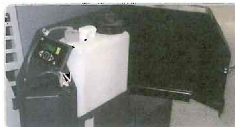
Captor® AXP™ allows control of detergent usage and the ability to use your choice of detergent