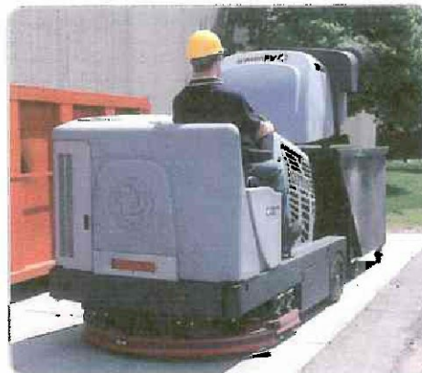
The ergonomic Clear-View™ design provides the operator with an unobstructed view of critical sweep zones