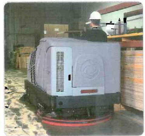
Aggressive scrub system removes ground-in dirt, while the squeegee leaves floors dry. Combined, you get complete cleaning in a single pass