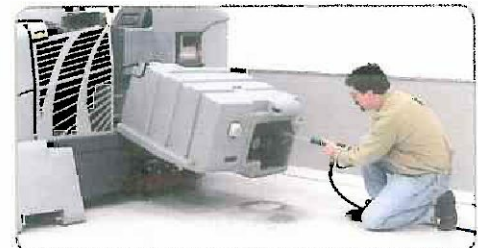
The tip-out recovery tank makes equipment clean-up safe and simple and helps keep your recovery tank fresh