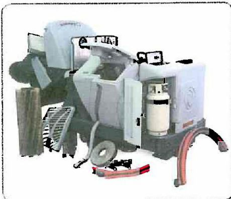
All major systems of the Captor® are readily accessible for easy inspection, cleaning and maintenance. Common maintenance and inspection operations can be completed without tools