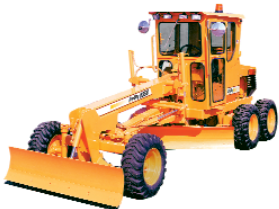
685 Motor Grader

“LeeBoy is dedicated to providing top quality parts and service support on every unit sold.”