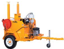
250 Tack Distributor