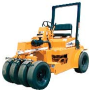
420 Asphalt Roller