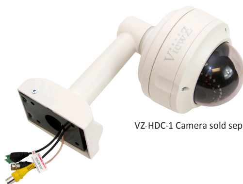
VZ-HDC-1 Camera sold separately